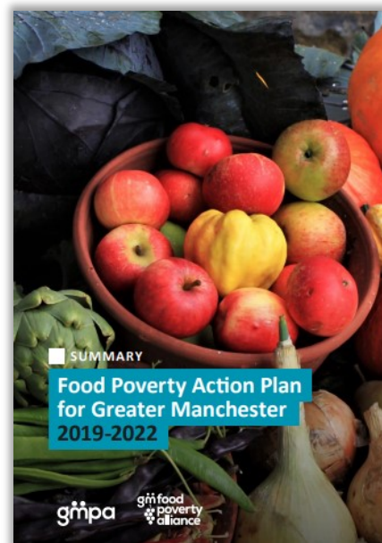
Tom Skinner Director, GM Poverty Action

However the 5 week wait for Universal Credit continues to increase household food insecurity, as does the 2-child limit. We also advocate substantially increasing Child Benefit and scrapping the benefit cap that limits the total amount of support a household can receive through the benefit system.